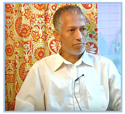
Watch one of our clients tell his story in his own words:

ABC provides some level of assistance to all people that contact our agency seeking help. This past year, we experienced increasing client requests for specific legal help related to health care coverage or insurance with increased complexity of those cases.